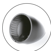
Inclined tweeter mounting Easy installation Soft touch finish